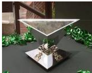
Triple Crown Trophy

Since 1978 only 23 horses have won the first two of the three races. If Justify doesn't win the Belmont then there will be 24 two-race winners. Will Justify become the next Triple Crown winner? Let's look at the probability.